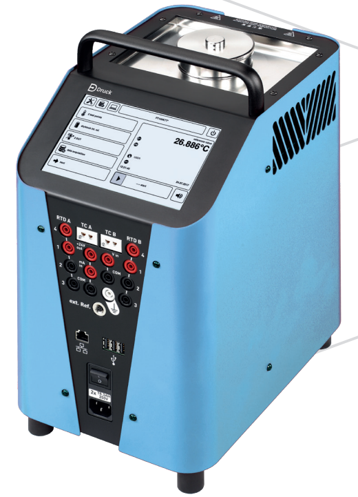
PTC165i Integrated measuring instrument